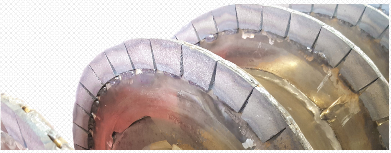
Decanter centrifuge fitted with Ferobide tiles