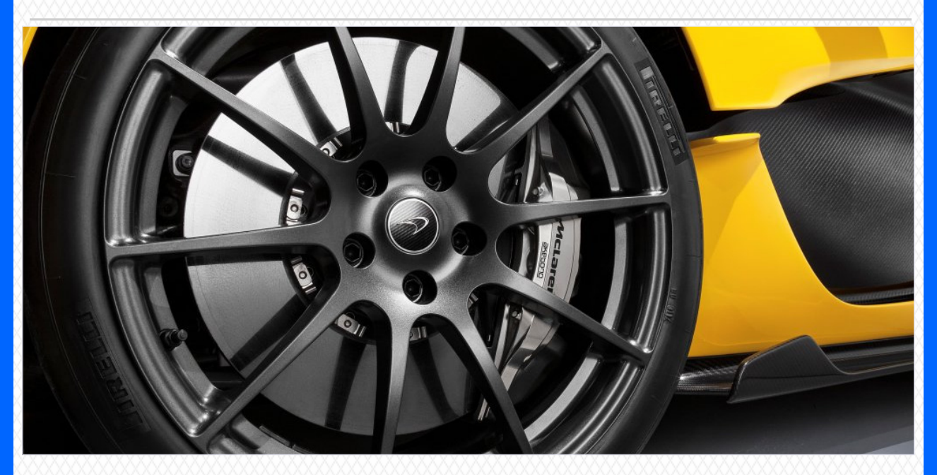
TENMAT High Temperature Materials have an industry wide reputation for providing the ultimate performance in the most extreme of environments.

This reputation for producing the ultimate performance materials is highlighted in the automotive industry. TENMAT has been providing its most formidable and robust ceramic coating to all of the brake discs in every McLaren P1 production supercar as well as the ultimate track focused driver's car, the P1 GTR.